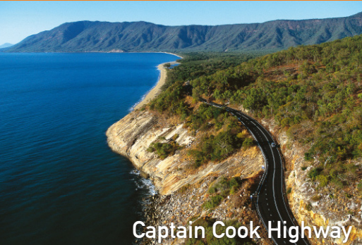
Captain Cook Highway