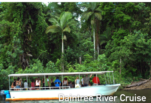
Daintree River Cruise