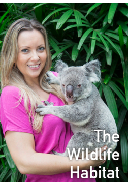
The Wildlife Habitat