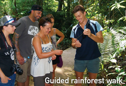
Guided rainforest walk